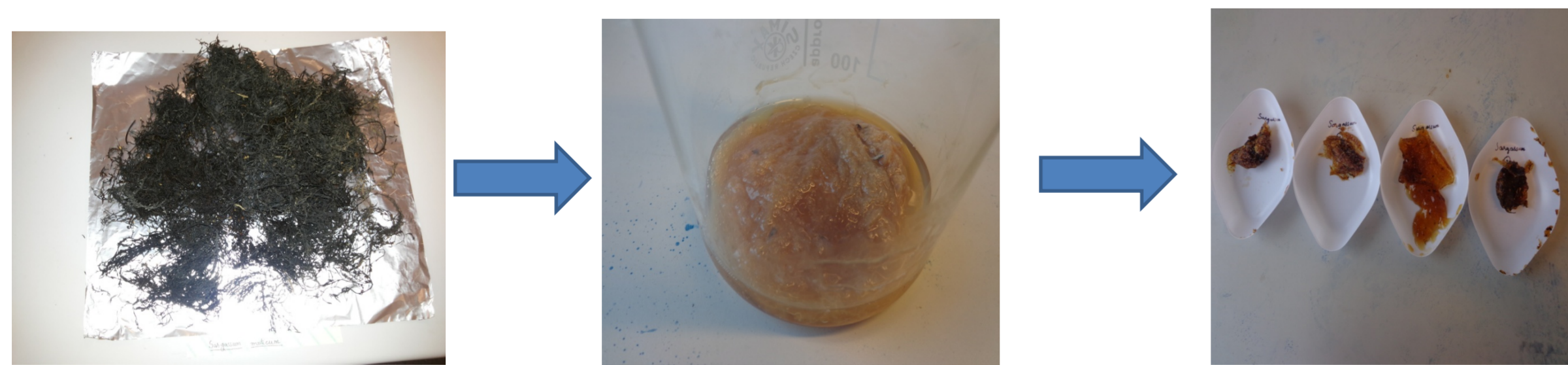
Fig 2 (a) dried algae (b) precipitated crude alginate (c) dried alginate

Dried at 65°C until constant weight reached