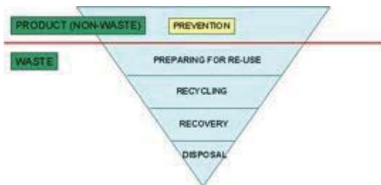
Fig. 2: European waste hierarchy [14]

The European hierarchy prioritises five different waste options, see figure 2 [14]. Out of these five options, the preferred one is waste prevention. The waste prevention strategy has been followed in the design phase of the building under study by reducing the amount of materials per square meter office space and choosing environmentally friendly building materials over materials containing hazardous substances.