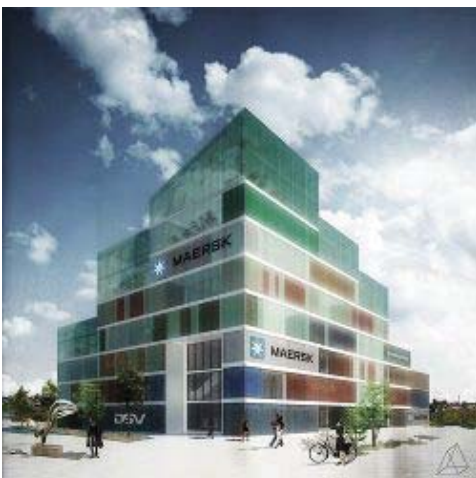
Fig. 1: The case study building 'Eco-Box'

The building itself is designed for assembly, disassembly and re-use of the materials. The dimensions of the leased materials determine the dimensions of the construction, rather than fitting the materials to the design. Thereby construction waste is reduced significantly, and the materials can be re-used directly after the use phase. The materials chosen for the building are materials which are traditionally leased for other purposes. They include shipping containers, scaffolding materials, lifts and pre-fitted bathroom containers. The containers are used as building blocks to form the outer wall of the building. The resulting modular design makes it possible to modify the layout and size of the building during operation, according to the changing needs of the tenants.