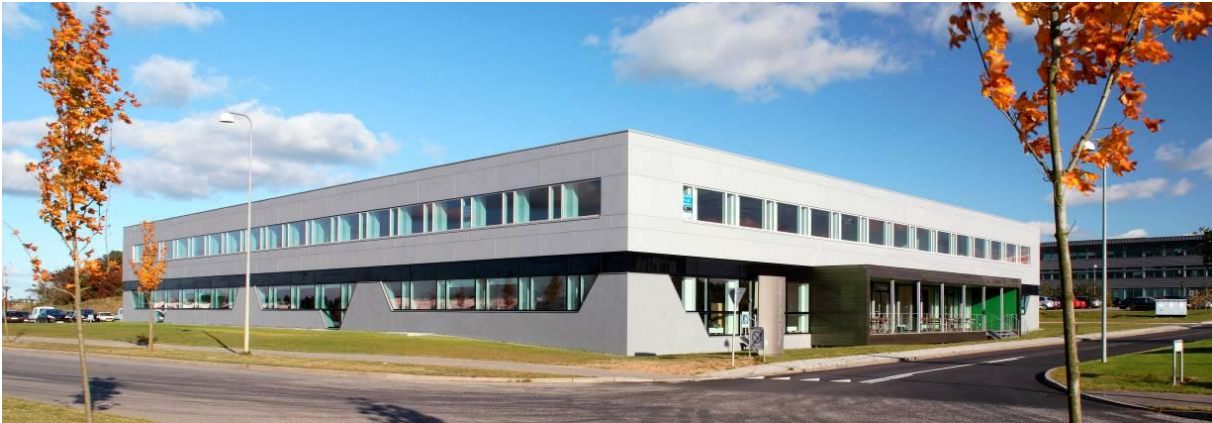
Figure 1 A picture of Company House III in Kolding, Denmark.