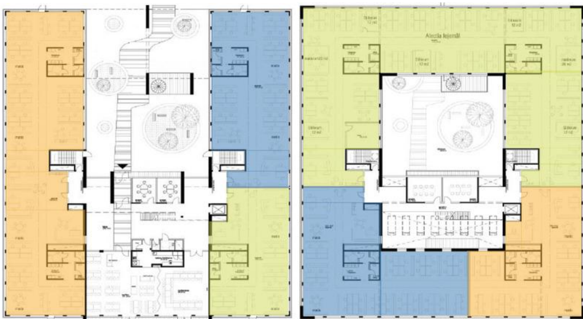
Figure 2 Plan drawings for Company House III in Kolding, Denmark. The colours indicate the various areas for lease and the white areas are common, shared facilities like arrivals area, canteen and meeting rooms.