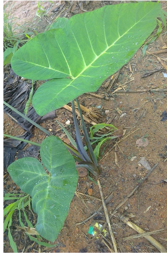
FIGURE 2 A young Xanthosoma sagittifolium (L.) Schott plant.

However, there were no concerted efforts to promote the growth and performance of cocoyam relative to other root and tuber crops until the outbreak of the root rot complex disease in 1925 after which two formal studies on the species were conducted in Ghana (Doku, 1966; Wright, 1930). There was a lack of information and follow-up studies on domesticated varieties until 1971 when Karikari carried out a germplasm assessment and collection (Karikari, 1971). This was then followed with an evaluation of the susceptibility of local and exotic varieties to the root rot complex disease (Karikari, 1979). Similar individual studies were also carried out (Offei, Asante, & Danquah, 2004; Opoku-agyeman et al., 2004; Safo-Kantanka & Adofo, 2007; Tortoe & Clerk, 2011) but with an absence of a common front to purposefully enhance the growth and performance of cocoyam (Quaye et al., 2010; Ramanatha et al., 2010).