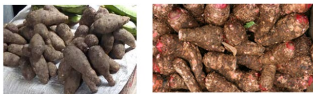
Cormels of different varieties of Xanthosoma sagittifolium