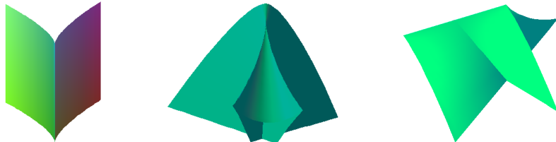
FIGURE 1. Left to right: Cuspidal edge, swallowtail and cuspidal cross cap.

In this article we will encounter three standard singularities: the cuspidal edge , given by f(u, v) = (u^2, u^3, v) , the swallowtail given by (3u^4 + u^2v, 4u^3 + 2uv, v) and the cuspidal cross cap given by (u, v^2, uv^3) (Figure 1). The first two singularities are fronts, but the third is only a frontal.