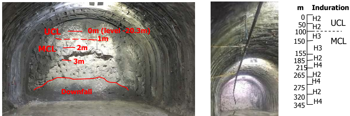
Fig. 4 Face logged cavern wall, Track 1. The face was logged every 3 m. A lift was used for the face logging. The holes in face are due to hammering. Note shotcreted ceiling. Indurations from logged face shown to the right.