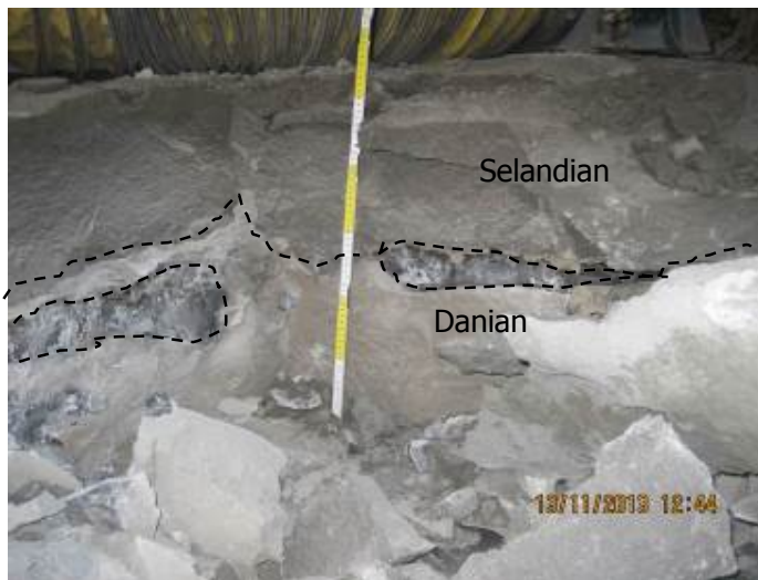
Fig. 3 The boundary between Selandian Greensand limestone and Danian Upper Copenhagen Limestone. Flint nodules observed just below the boundary. The nodules are infilled burrows.

As mentioned earlier, Sbv is located in the reference area for the Paleocene Greensand Formation. At Sbv around 4 m of fossil-rich, only slightly lithified Greensand was observed below the Quaternary clay till and above the Greensand conglomerate. The Greensand conglomerate below the Greensand constitutes the boundary to the Upper Copenhagen Limestone. The boundary is well defined with a shift in colour from dark greenish grey to light grey. Just below the boundary horizontal burrows infilled with flint are observed. The top of Upper Copenhagen Limestone has been observed in 7 face log profiles, from level -7.9 to -9.3 m. The boundary between UCL and MCL was recorded in 2 profiles; at level -22.0 to -22.3 m. MCL was recorded from this level to bottom of excavation around level -32 m. The face logged limestone is dominated by induration H2 and H3, both in Upper and Middle Copenhagen Limestone.