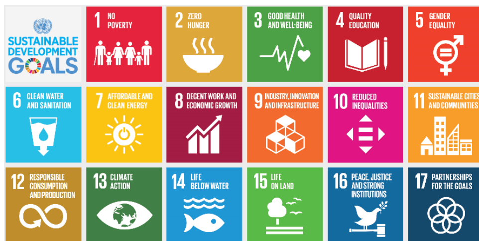
Figure 1. UN’ 17 Sustainable Development Goals.

In March 2015 UN’ 17 Sustainable Development Goals were introduced. The 17 SDGs are divided into 169 targets and 330 indicators, however rapid assessment showed that only 105 indicators are quantifiable [5]. There is a great need for operationalising the SDGs targets and evaluate the indicators in relation to the building industry. [5]. There is a call for action to construct solutions for the sustainable development goals, and different networks is currently working on quantifying the SDGs [19].