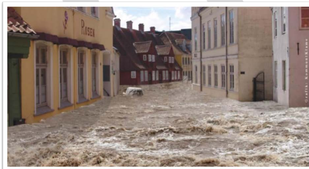
Graphical representation of Åbenrå Disaster Exhibition, Struer Museum

Homeowners will be economically incentivized to adapt to climate change. It will incentivize the building sector to build for the weather of the future. There will be reduced climate damage losses. The insurance sector can advise on how to protect property and will benefit from the transparency. And a technical basis for a market for climate auditors will be developed.