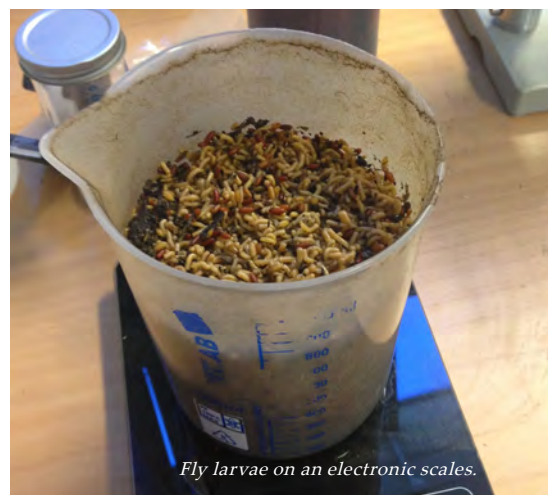
Fly larvae on an electronic scales.

In a one week process, manure will be converted to compost and the live larvae will be harvested and used for feeding laying hens. The larvae are expected to have a beneficial effect on the growth performance, intestinal health and on animal behavior in flocks.