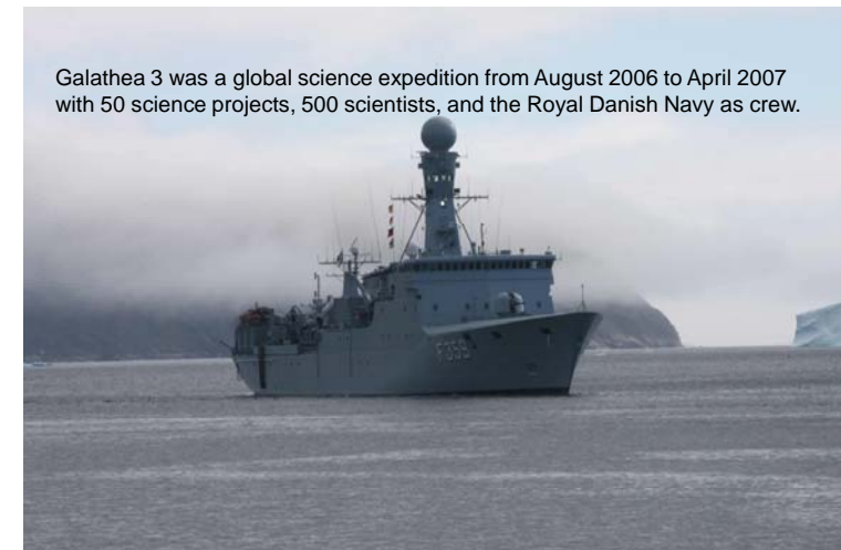
Galathea 3 was a global science expedition from August 2006 to April 2007 with 50 science projects, 500 scientists, and the Royal Danish Navy as crew.