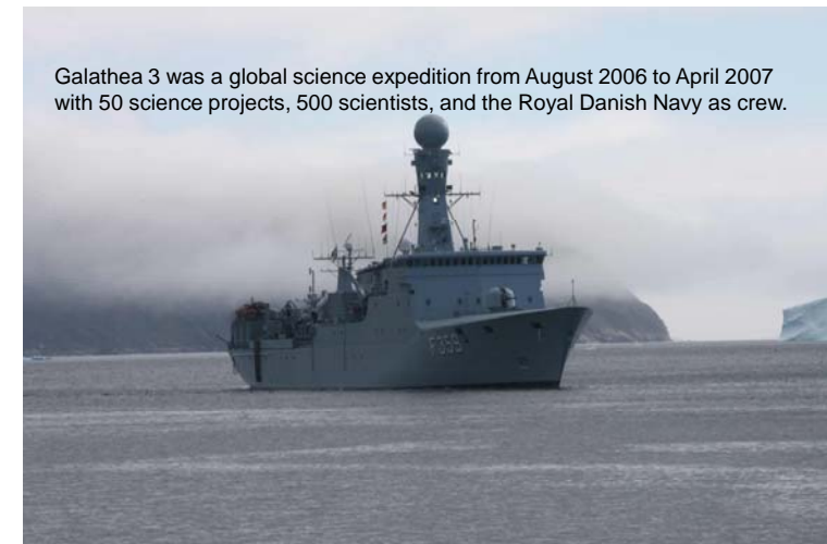
Galathea 3 was a global science expedition from August 2006 to April 2007 with 50 science projects, 500 scientists, and the Royal Danish Navy as crew.