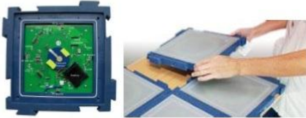
Figure 1: Left: The interior of the modular interactive tiles. Right: Assembling of a tile play field.

interaction patterns by the users when playing the games, e.g. the tiles can be changed from a 3*3 square to a horse-shoe shape in less than a minute.