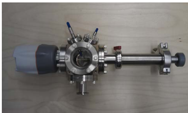
Figure 2. The ex situ INPS-TEM reactor. The system is shown with a TEM holder inserted, the pressure gauge and optical ports.