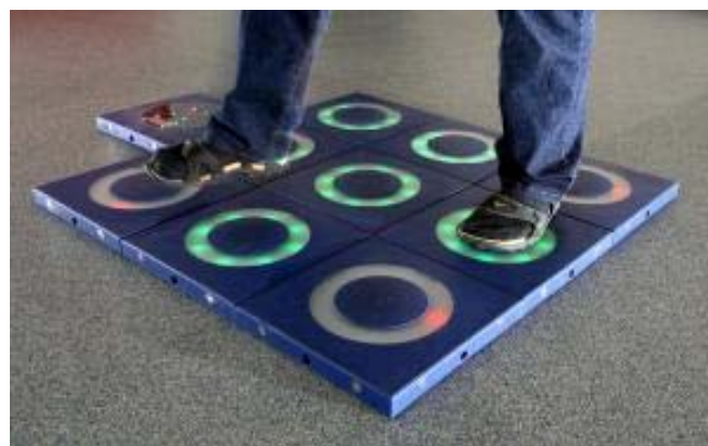
Fig. 1. Modular robotic tiles used for playful physiotherapy.

H. H. Lund is with the Center for Playware, Technical University of Denmark, Building 325, 2800 Kgs. Lyngby, Denmark (phone:+45 45253929; email: hhl@playware.dtu.dk ).