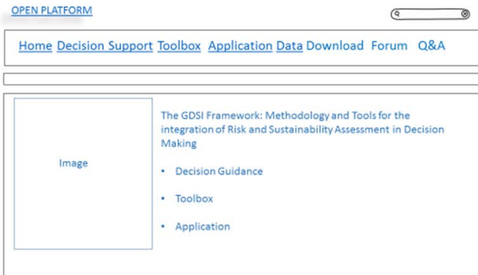
Figure 3. Submenu 'Decision Support'