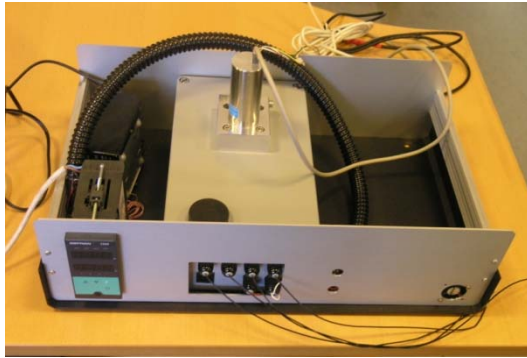
Figure 1. External view of the light-tight box containing the microfluidic cartridge. The photomultiplier shown in the picture is placed perpendicular to the surface of the cartridge and the collected signal is transmitted to a PC.