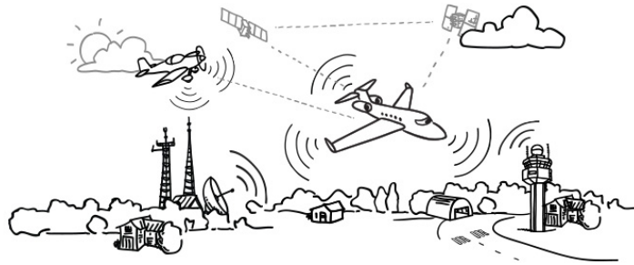
Fig. 14. Overview of the ADS-B system.

In a recent evaluation, GSD was used to model and verify the Automatic Dependent Surveillance-Broadcast (ADS-B) 3 system [23], an air traffic management surveillance system that is being deployed with the intent of replacing the radar as the main system for airspace traffic management. This section first introduces the current implementation of ADS-B and then presents the way GSD was used to verify ADS-B.