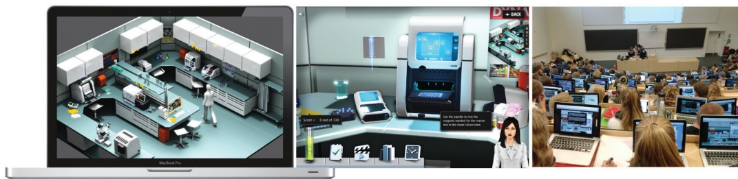
Figure 1 Screenshots from the gamified laboratory simulation tested in this study (Labster, www.labster.com ) (left, center). Students used the simulations from regular computers at home (in the case of testing at Stanford University Online High School) or in class (right).

We also conducted a study on 57 students from four Danish high schools. Forty-four percent of the students agreed or completely agreed with the statement, “I consider pursuing an education within biotechnology or other biological subject to a greater extent, after having used the gamified laboratory simulator.” This indicates that gamified laboratory simulations may provide a powerful case for initiatives to increase students' engagement and motivation for further studies and careers within biotech. Large-scale longitudinal studies measuring the actual study and career choices of students exposed to gamified laboratory simulations compared with a control group would be valuable to guide future decisions.